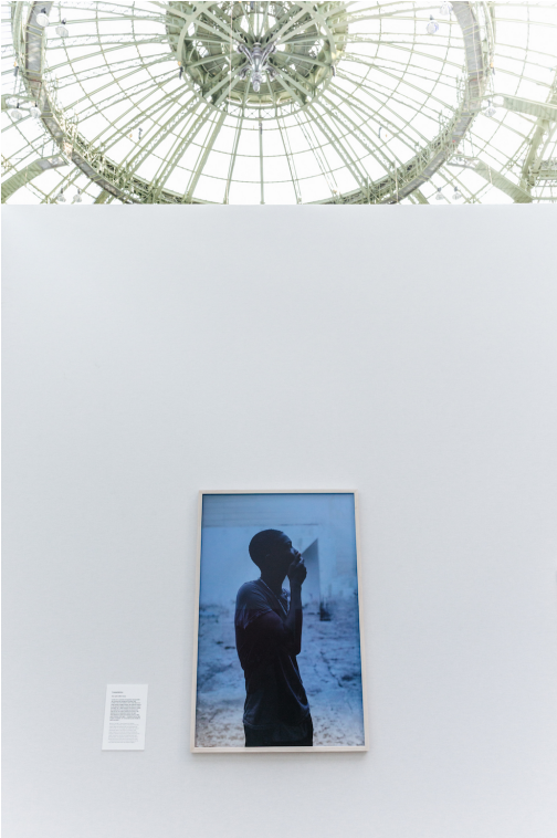
Legend : shooting of the stand, Plátanos con Platino #7, © Elsa Leydier, Le Grand Palais, September 2020