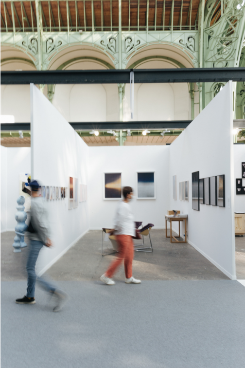
Legend : shooting of the stand, Le Grand Palais, septembre 2020